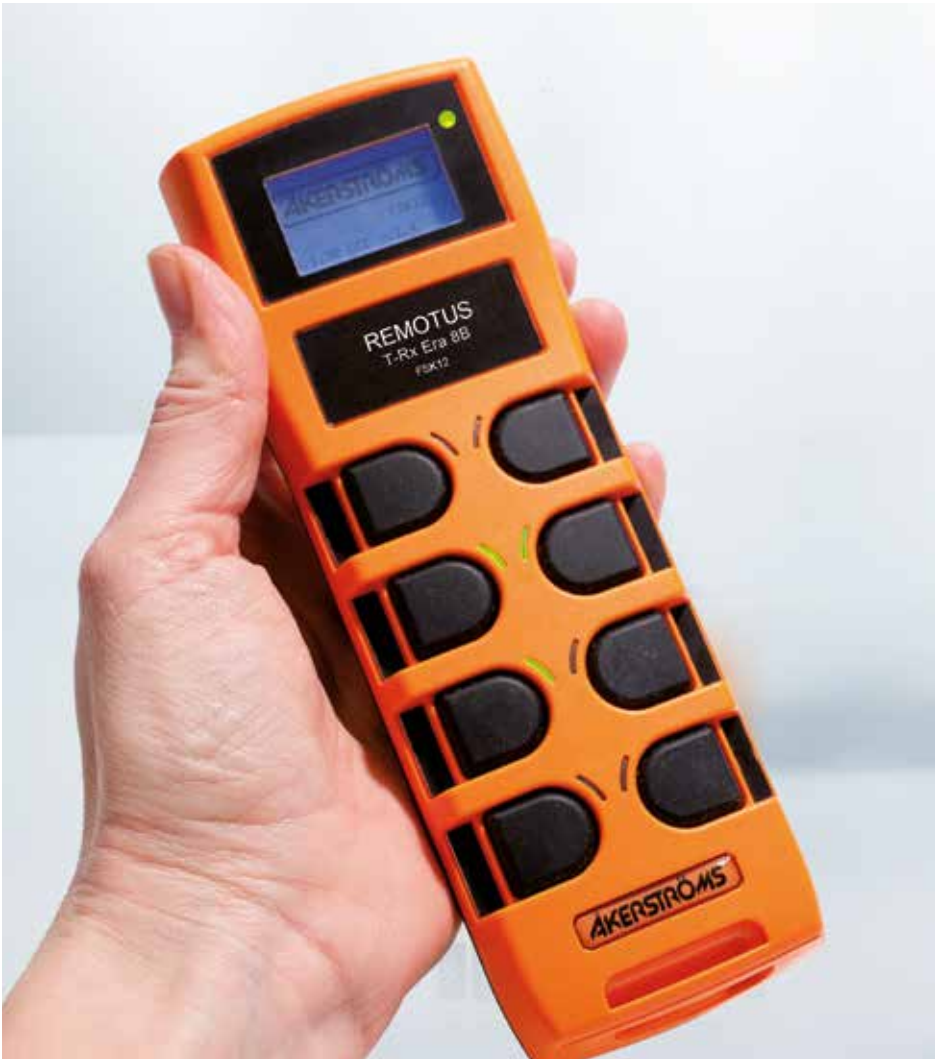
REMOTUS T-RX ERA 8B